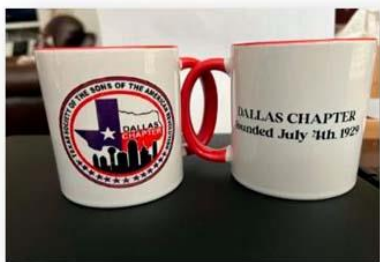
New Dallas Coffee Mugs

We have Metal and Wood Challenge Coins, 125 th Anniversary Medal Set, and a Patriot House Banner to aid our Chapter in the efforts raise money for our youth programs.