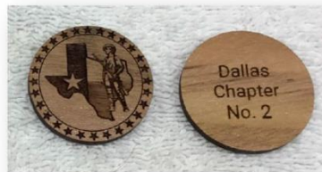
Wood Challenge Coin