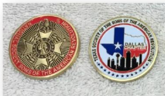
New Dallas Challenge Coin