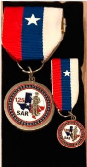
125 th Anniversary Medal Set