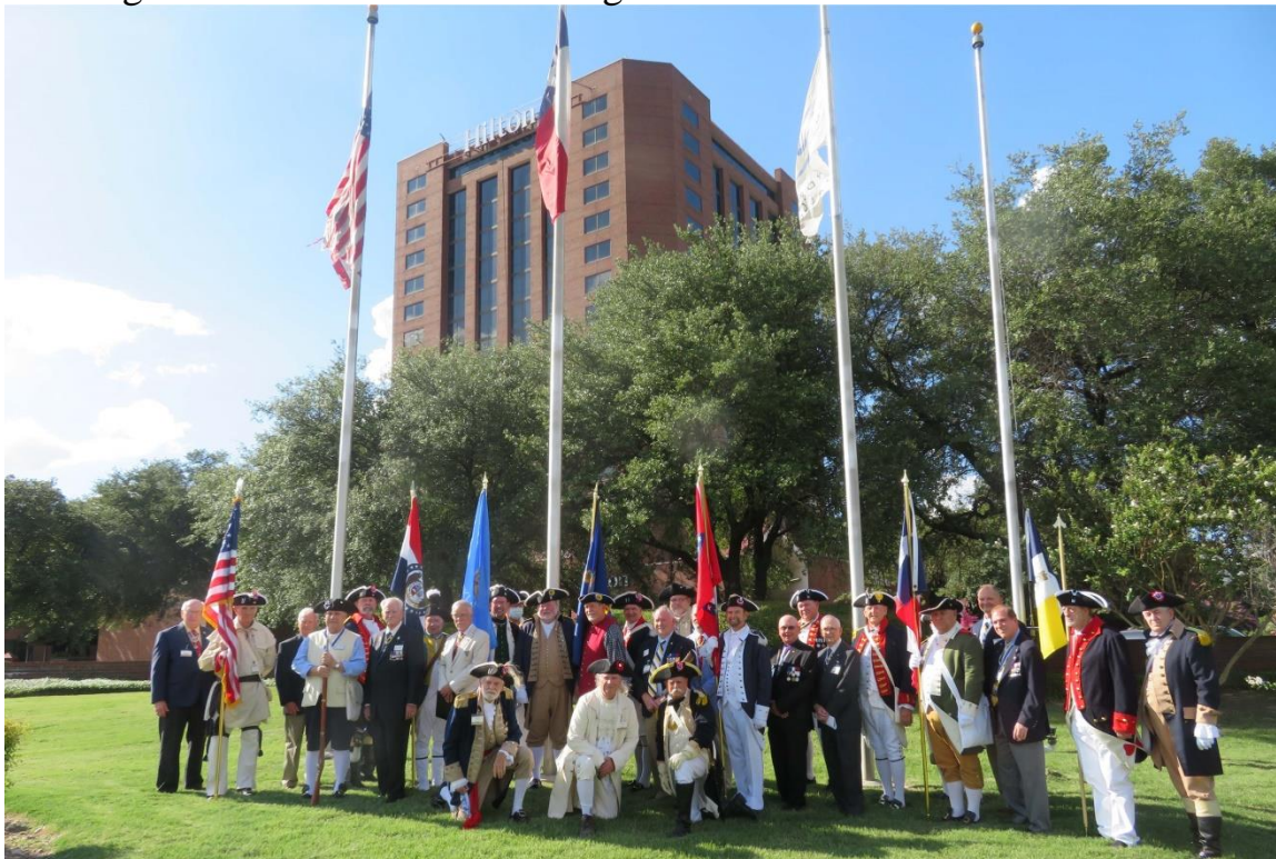
2021 South Central District Meeting

Since our last meeting the Dallas Chapter Color Guard participated in the South Central District Meeting in Richardson. This meeting was a National event for the Color Guard.