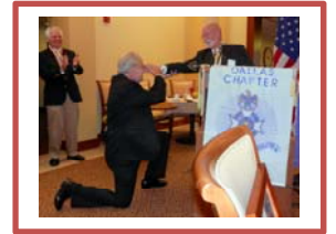
THE SECRETARY BEING KNIGHTED (for the last time)