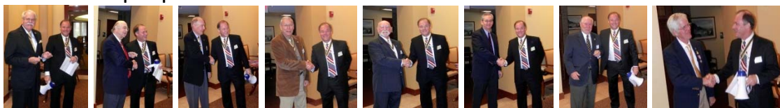
TW-01 RM-02 TS-03 AC-07 BN-08 DT-09 JF-11 RK-12