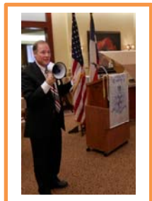
The Good Doctor