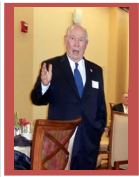
He also will be pulling the "Boat Float" during Veterans Day parade

Secretary Whitelock asked for motion of approval of the distributed September minutes and received a favorable voice vote. Treasurer Temple reported 28 members and 6 guests in attendance. He also has recorded the following balances as of 9/30/2012: Checking Account - $3,550.79, Minuteman Fund-$10,411.87 and Ritchie Fund-$30,484.26.