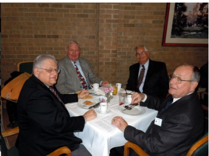
The “Bro’ s from the backwoods”